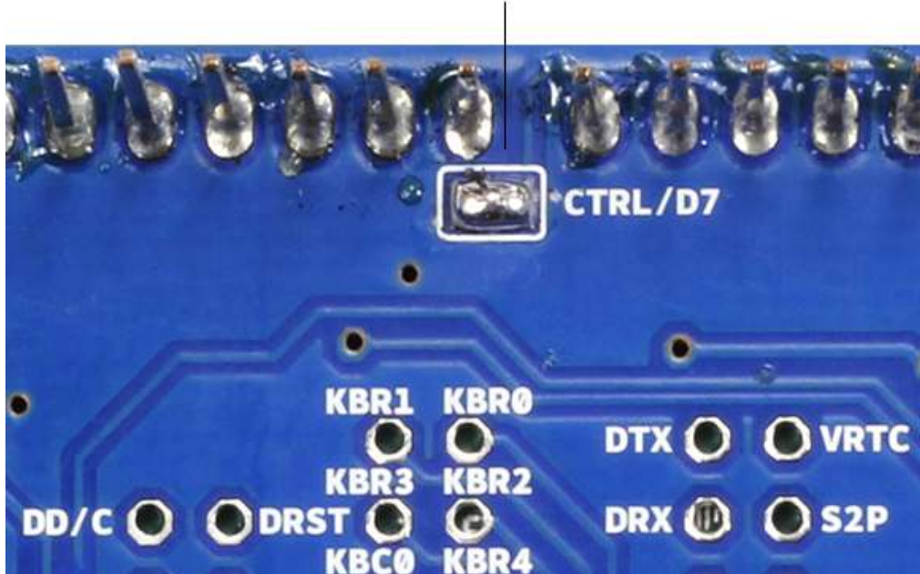
Bridged pin to automatically power the modem

Several of the modem pins are exposed on the underside of the board. These provide access to the modem for features like speaker output and microphone input. See the datasheet for complete information.