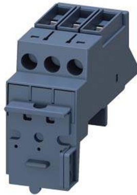
Disconnecter module for circuit breaker Size S2