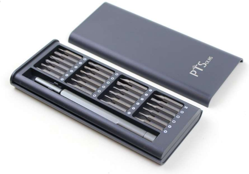
Figure 2: Identification of the 24 bits.

➡ PH000 PH00 PH0 PH1 PH2 ➡ SL1.5 SL3.0 SL4.0 ➡ T2 T3 T4 T5 T6H T8H T10H ➡ H1.5 H2.0 ➡ Y0.6 Y1.5 Y2.5 ➡ P2(☆0.8) P5(☆1.2) ▲ △2.3 ➡ U2.6