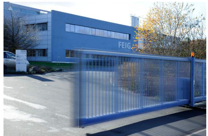
Perimeter Protection: Fast and safe access to industrial plants etc.

Suitable loop detectors and motion detectors are available from FEIG ELECTRONIC.