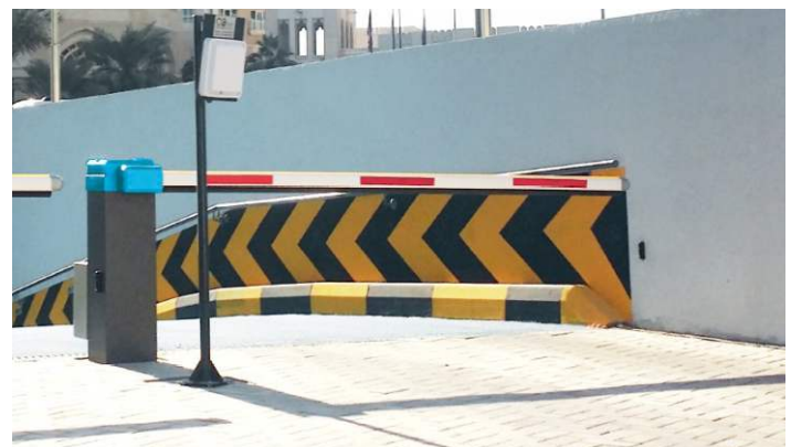
Parking Management: Comfortable access without waiting