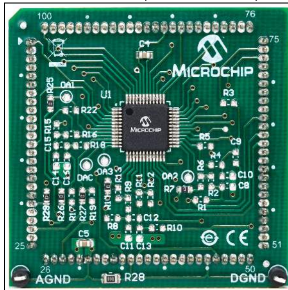
FIGURE 1: dsPIC33CK64MP105 MOTOR CONTROL PIM FOR EXTERNAL OP AMP (P/N: MA330050-1)

Table 1 provides information on the hardware versions of the motor control boards that are compatible with this PIM. Refer to the specific motor control board user's guide for the hardware version identification information.