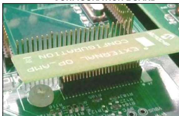
FIGURE 2: EXTERNAL OP AMP CONFIGURATION BOARD

Table 1 provides information on the hardware versions of the motor control boards that are compatible with this PIM. Refer to the specific motor control board user's guide for the hardware version identification information.