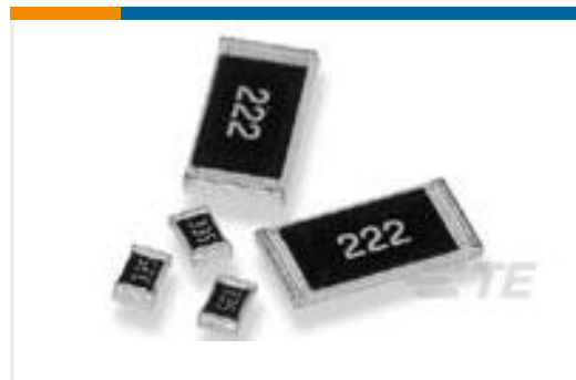
TE Part #1622918-1 CRG0603 1% 330R