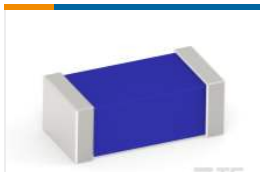
TE Part #2108838-1 Chip ant., SMD, BT/Wi-Fi 2.4GHz