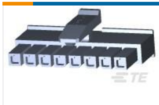
TE Part #1445022-8 MICRO MNL RFECEPT HSG SINGLE R