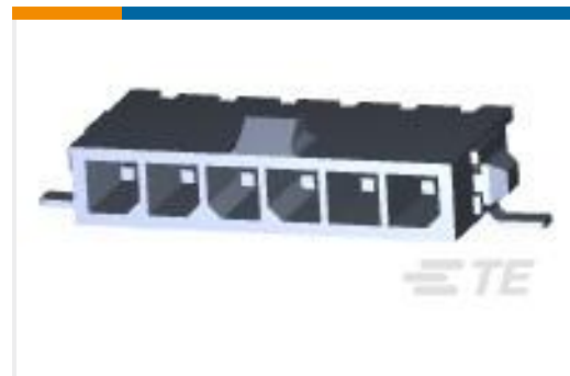
TE Part #2-1445100-6 MICRO MNL HDR ASSY S/ROW LF