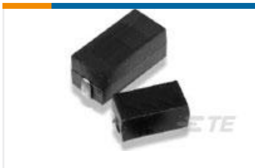
TE Part #3-1879233-9 SMW5 3R9 5%