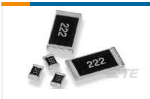
TE Part #1622877-1 CRG0603 1% 1M0