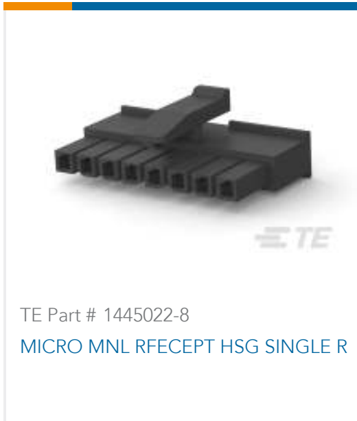
TE Part # 1445022-8 MICRO MNL RFECEPT HSG SINGLE R