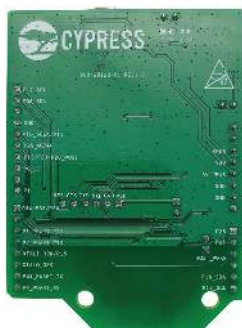
Figure 2: CYBT-483039-EVAL Bottom View

SW1: Reset Switch routed to the XRES connection on the module.