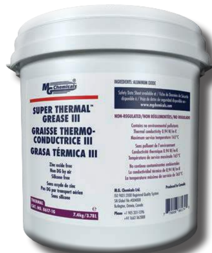
1 Gallon Pail