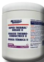
1 Pint Jar