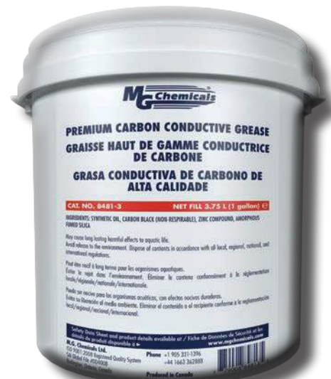
1 Gallon Pail