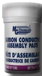
25 mL Jar