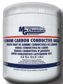
1 Pint Jar