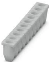
Insulating sleeve, color: gray

https://www.phoenixcontact.com/us/products/3031034