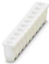
Insulating sleeve, color: white

https://www.phoenixcontact.com/us/products/3206131