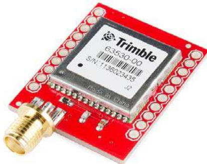
The Copernicus II DIP Module

The module supports NMEA, TSIP and TAIP protocols at 1 Hz. The board also is designed to interface with an SMA antenna.