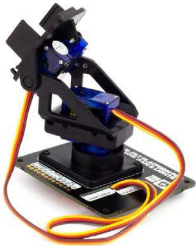
Full kit PIM183