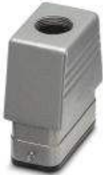
HEAVYCON sleeve housing, D15, for single locking latch, height: 66 mm, without 1 x M25 support, straight cable outlet

Please be informed that the data shown in this PDF Document is generated from our Online Catalog. Please find the complete data in the user's documentation. Our General Terms of Use for Downloads are valid ( http://phoenixcontact.com/download )