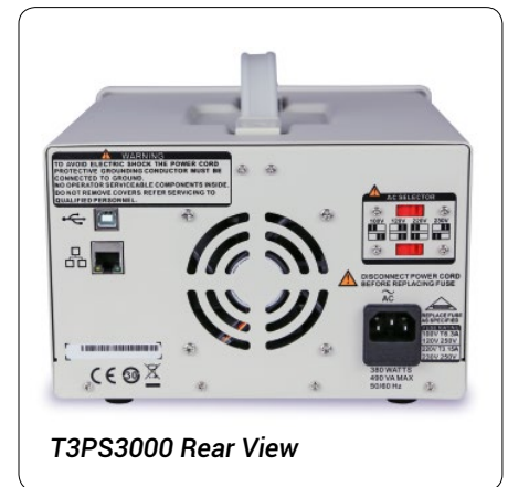
T3PS3000 Rear View