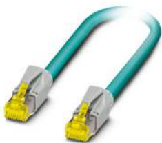
Patch cable, degree of protection: IP20, number of positions: 8, 10 Gbps, CAT6 A , cable outlet: straight, Ethernet

https://www.phoenixcontact.com/us/products/1411854