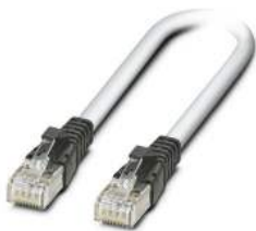
Patch cable, CAT5, assembled, 2 m

https://www.phoenixcontact.com/us/products/2832289