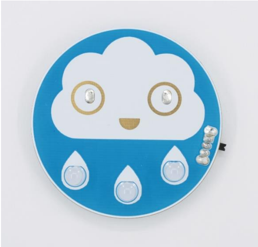
Front of board with battery holder: