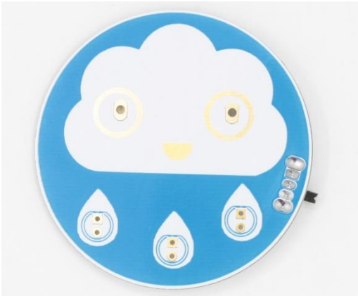
Front of board with switch: