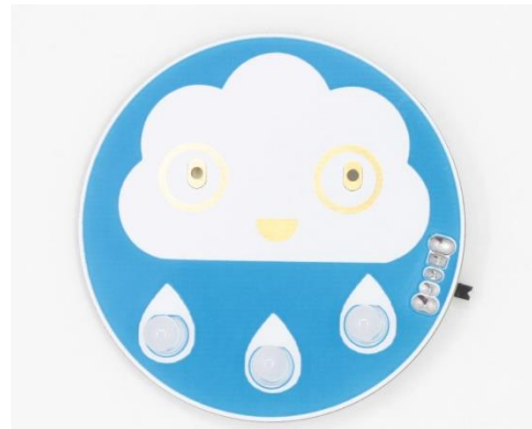
Front of board with LEDs: