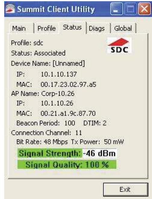
SCU is a graphical utility for configuration, troubleshooting, and management