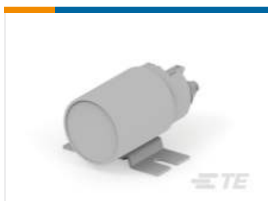
TE Part #K1011766 Relay 29-214-11