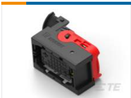
TE Part #1-2328352-2 25POS, MIXED,REC HSG,ASSY, SEALED, COD A