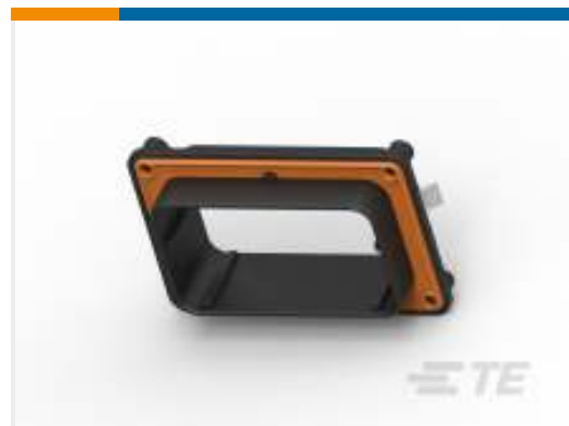
TE Part #DRBF-1A FLANGE, MOUNT, 102/128P, BLK, A