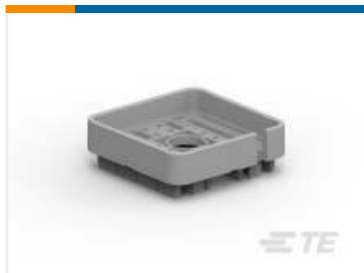
TE Part #WB-64SA DEUTSCH DRB Wedgelocks