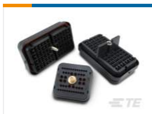
TE Part #DRB12-128PAE-L018 DEUTSCH DRB Housings