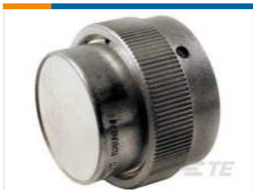
TE Part #HDC36-24-1E DUST CAP, 24SZ, REC, AL, NO LANYARD,HD30