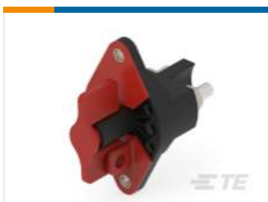
TE Part #K5000061 Batt. Disconnecter 35-314-131-R-901