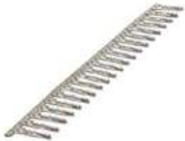
Rolled female contact, taped, silver-plated, 1.5 mm 2 ... 2.5 mm 2 left contact lead-in, 2000 pieces per roll

Please be informed that the data shown in this PDF Document is generated from our Online Catalog. Please find the complete data in the user's documentation. Our General Terms of Use for Downloads are valid ( http://phoenixcontact.com/download )