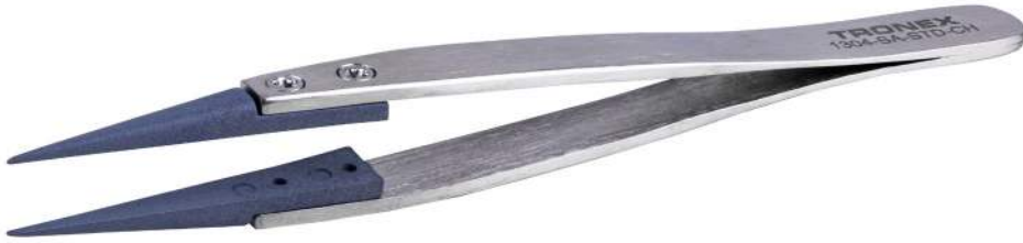
Replacement Tips Item: TIP-STD-4-CH