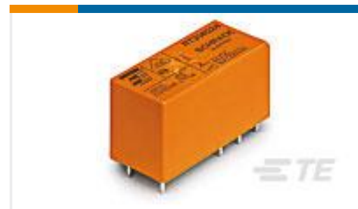
TE Part #5-1393239-5 RT214024