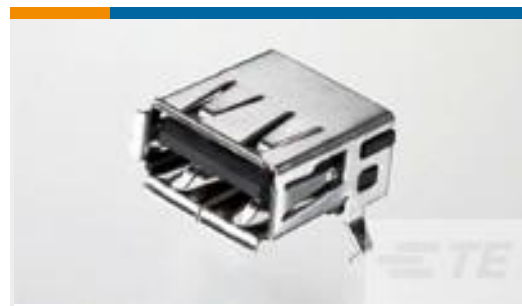
TE Part #292303-2 Std USB Type A, R/A, T/H