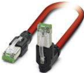
SERCOS III patch cable, shielded, star quad, AWG 22 stranded (7-wire), RAL 3020 (traffic red), RJ45 connector/IP 20, straight, to RJ45 connector/IP20, angled, length: 0.3 m

Please be informed that the data shown in this PDF Document is generated from our Online Catalog. Please find the complete data in the user's documentation. Our General Terms of Use for Downloads are valid ( http://download.phoenixcontact.com )