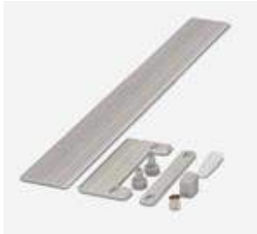
Spacer rollers for regular rail spacing, required for ground terminal blocks, material: Nickel-plated brass

Please be informed that the data shown in this PDF Document is generated from our Online Catalog. Please find the complete data in the user's documentation. Our General Terms of Use for Downloads are valid ( http://phoenixcontact.com/download )