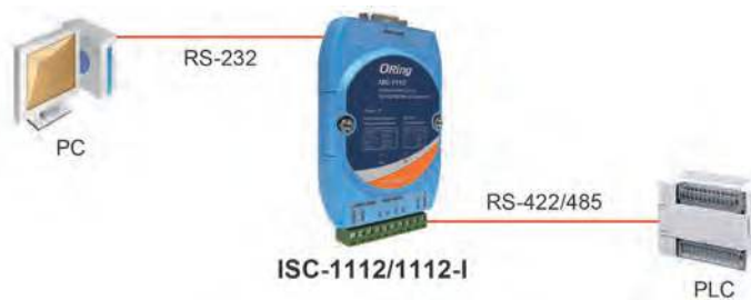
Connections of Serial Media Converter

ISC-1112 series are industrial media converters provide media conversion between RS-232 and RS-422/485 interface. ISC-1112 series are ABS housing design and supporting an operating temperature of -10 to 70°C. The RS-485 control is completely transparent to the user and software written for half-duplex operation without any modification. ISC-1112-I opto-isolators provide 3000VDC of isolation to protect the host computer from destructive voltage spikes. Therefore, the ISC-1112 series is reliable serial media converter and can satisfy most demand of operating environment.