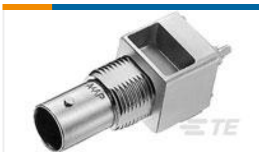
TE Part #5227673-1 BNC PCB VERTICAL JACK W/POST