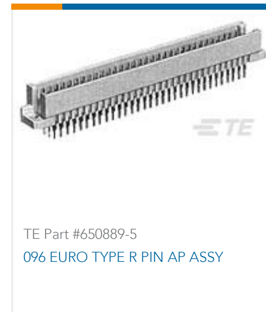
TE Part #650889-5 096 EURO TYPE R PIN AP ASSY