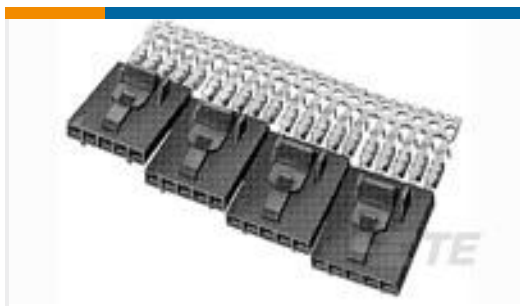
TE Part # 103957-1 10X2 MTE RCPT SR LATCH .100CL