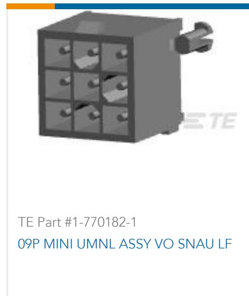
TE Part #1-770182-1 09P MINI UMNL ASSY VO SNAU LF