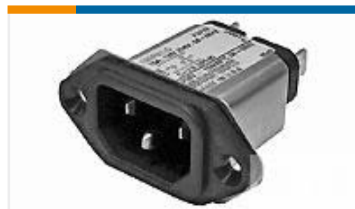
TE Part #6609987-8 15SRB1-Z=F8219G