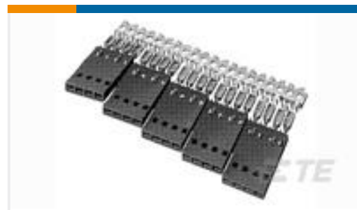
TE Part # 103969-1 10X2 MTE RCPT SR RIBBED .100CL