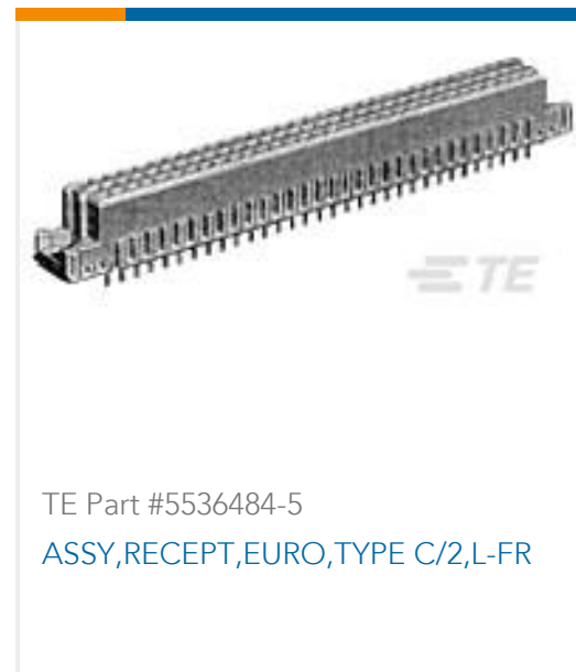
TE Part #5536484-5 ASSY,RECEPT,EURO,TYPE C/2,L-FR