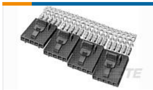
TE Part # 103960-1 10X2 MTE RCPT SR LATCH .100CL