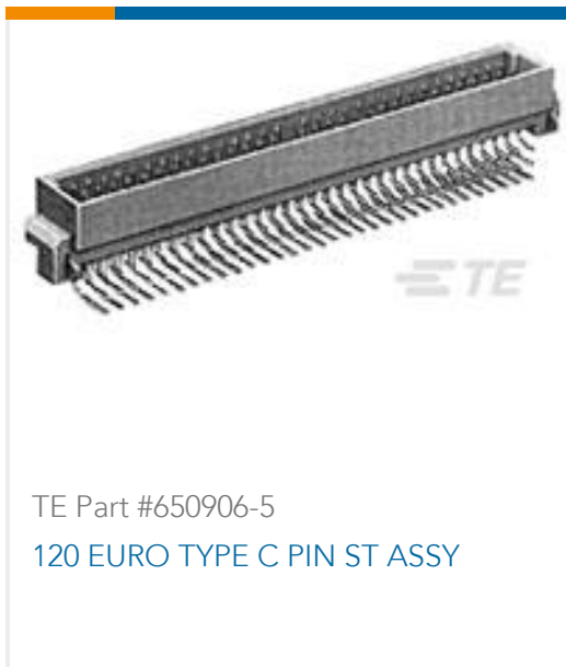
TE Part #650906-5 120 EURO TYPE C PIN ST ASSY