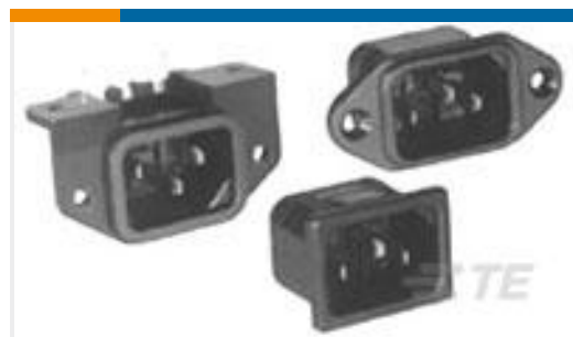
TE Part #1609133-1 6ESRF-3=F6988