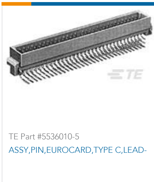
TE Part #5536010-5 ASSY,PIN,EUROCARD,TYPE C,LEAD-