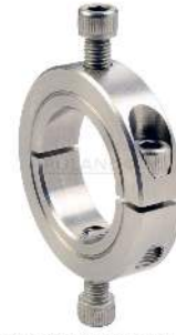
*Additional hardware #01 included