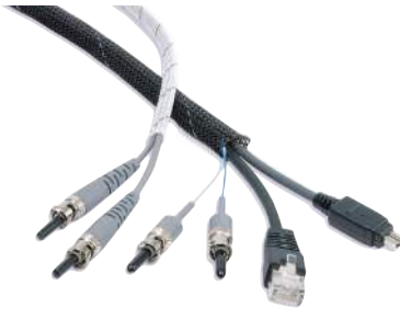
Many telecommunications companies rely on Flexo Halar® for their plenum wiring systems.