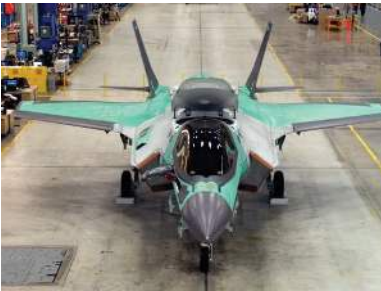
Halar's® low outgassing, as well as its heat, chemical, and radiation properties, make it ideal for use as a component in technologically advanced applications.