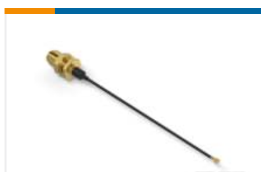
TE Part #2016694-2 RF CA,UMCC4 TO SMA JACK,1.13MM, L100MM