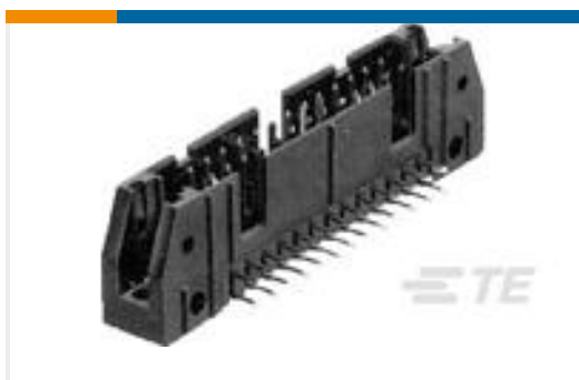
TE Part #5102160-8 A/L UNIV HDR 34P RA