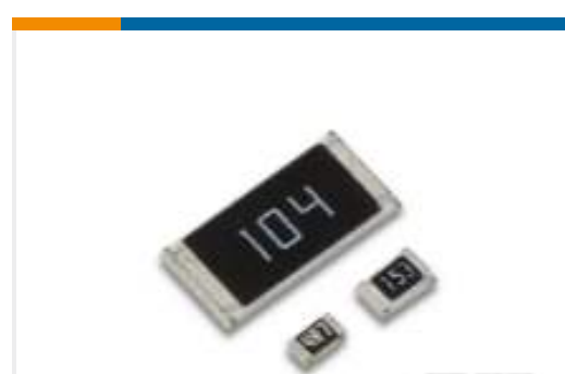
TE Part #5-2176345-4 CRGCO 1210 270K 1%