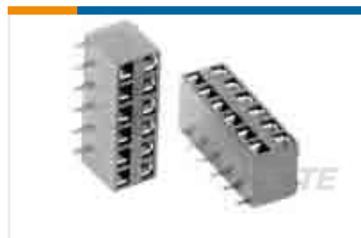
TE Part #969973-6 2x6P HV100 REC. CON, SMD, GOLD, BLISTER