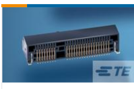
TE Part #2041262-1 Mini PCI-E 6.8H G/F