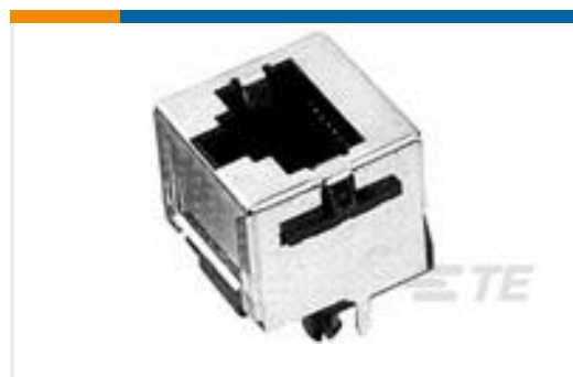
TE Part #1734577-4 MOD-JK,8P8C,SHD W/LED, G/Y,50U"