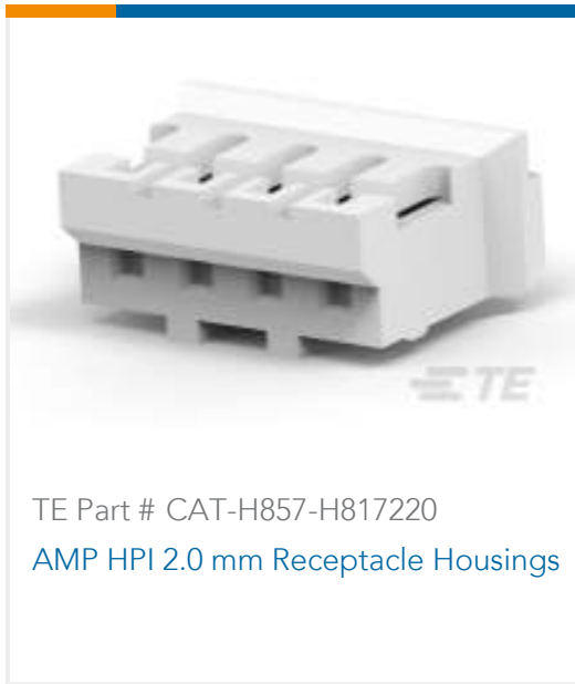
TE Part # CAT-H857-H817220 AMP HPI 2.0 mm Receptacle Housings