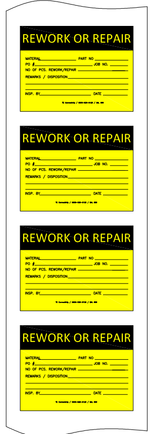
PARTIAL ROLL VIEW

NOTES FINISHED PRODUCT TO BE DELIVERED ON ROLLS AS SHOWN