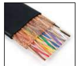
3M™ Twisted Pair Shielded Jacketed Flat Cable