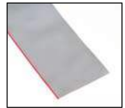
3M™ Round Conductor Flat Cable