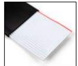
3M™ Jacketed Flat Cable