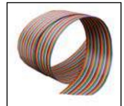
3M™ Color Coded Flat Cable