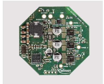
Figure: Reference design for auxiliary water pump