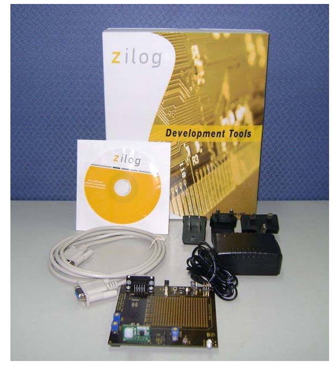
Figure 1. ZMOTION Detection Module Evaluation Kit Components