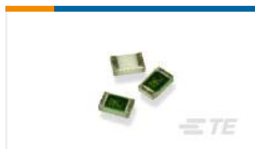
TE Part #1879213-1 CPF 0402 26R1 0.1% 25PPM 1K RL