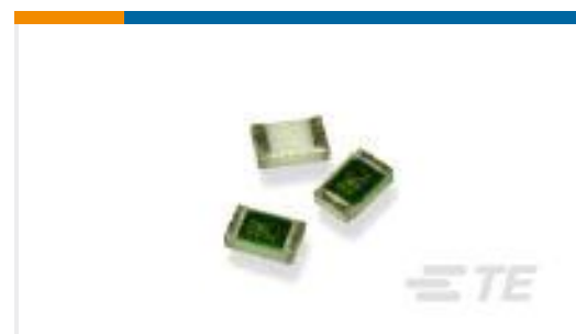
TE Part #1614882-3 CPF0603 E 0.1% 1K0 1K RL