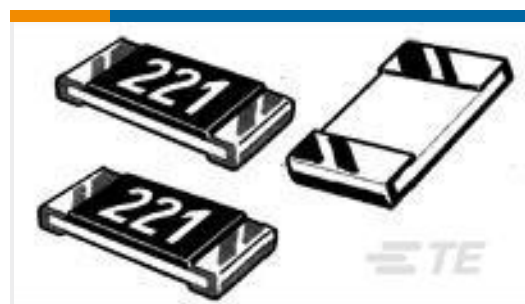
TE Part #1-2176231-8 3522 51R 1% 3W