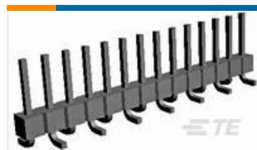
TE Part #1241150-3 3P MOD II BREAK AWAY HDR,SMD, BLISTER