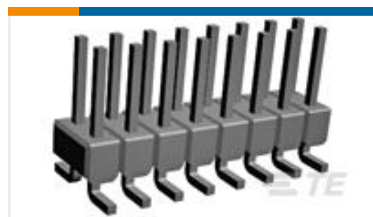
TE Part #1241050-8 2x8P MOD II BREAK AWAY HDR,SMD, BLISTER