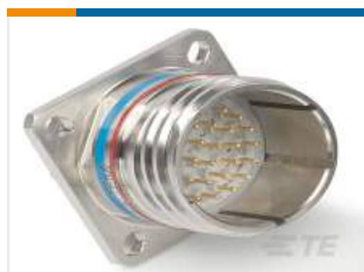
TE Part #DTS20F25-44420BN RECEPT.SQ FLANGE. 4 x #4. 4 x #20. NO CO