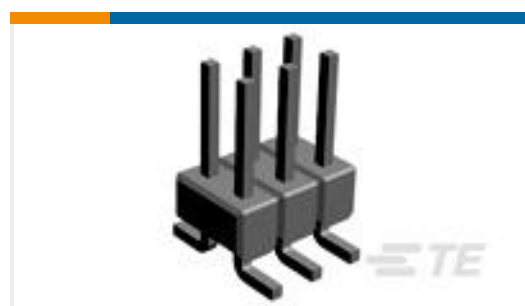
TE Part #1241050-3 2x3P MOD II BREAK AWAY HDR,SMD, BLISTER