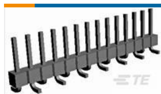
TE Part #1-1241150-0 10P MOD II BREAK AWAY HDR,SMD, BLISTER