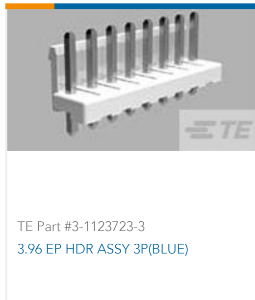
TE Part #3-1123723-3 3.96 EP HDR ASSY 3P(BLUE)