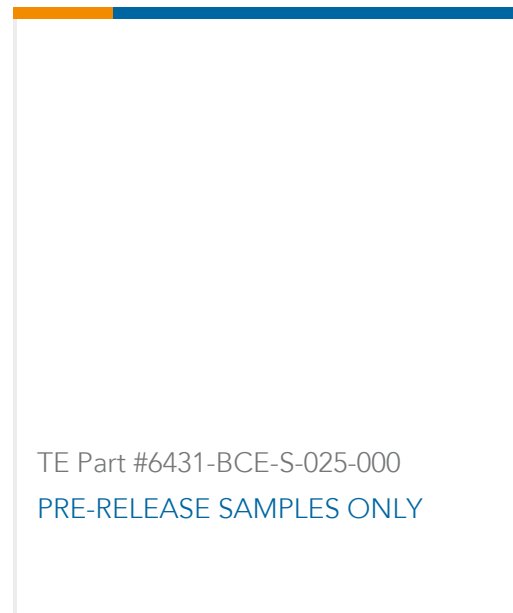
TE Part #6431-BCE-S-025-000 PRE-RELEASE SAMPLES ONLY