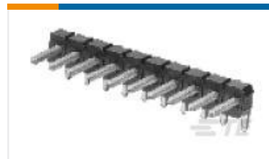
TE Part #9-146305-0 40 MODII HD SRRA B/A .100CL,LF