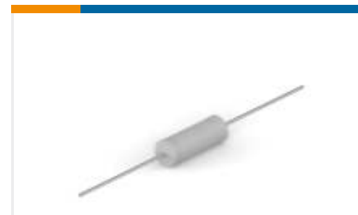
TE Part #7-2176412-8 5W XSM M/OX 5% 8K2