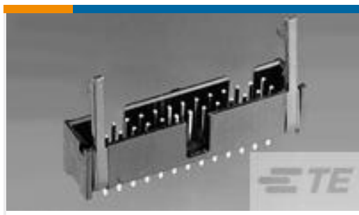
TE Part #2-1761609-6 IDC LOW PRO HDR 16P RA SHT LAT