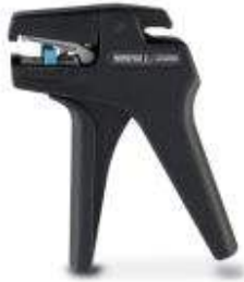
Stripping tool, for conductors and cables of 0.08 to 2.5 mm diameter

Please be informed that the data shown in this PDF Document is generated from our Online Catalog. Please find the complete data in the user's documentation. Our General Terms of Use for Downloads are valid ( http://download.phoenixcontact.com )