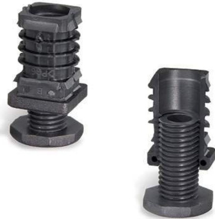
NDA.Q-20 ÷ NDA.Q-25

End-caps for square tubes with adjustable height levelling element The assembly can be performed simply by positioning the end-cap, forcing it, inside the tube, with no need of screws or other fasteners.