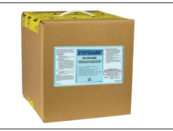
Figure 1. Statguard® ESD Floor Cleaner