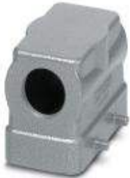
HEAVYCON B10 sleeve housing, for double locking latch, height: 56 mm, with 1 x M20 thread, lateral cable outlet

Please be informed that the data shown in this PDF Document is generated from our Online Catalog. Please find the complete data in the user's documentation. Our General Terms of Use for Downloads are valid ( http://phoenixcontact.com/download )