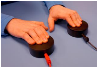
"Press and Test" Travel Probes

Meets requirements of ANSI/ESD S4.1, S7.1, S2.1 and STM12.1 and STM97.1