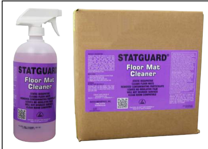
Figure 1. Statguard® Floor Mat Cleaner 1 Quart Spray Bottle (10443) 2.5 Gallons Bag-in-Box (10444) 5.0 Gallons Bag-in-Box (10445)