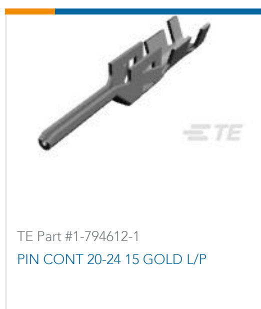
TE Part #1-794612-1 PIN CONT 20-24 15 GOLD L/P