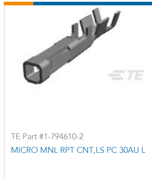
TE Part #1-794610-2 MICRO MNL RPT CNT,LS PC 30AU L