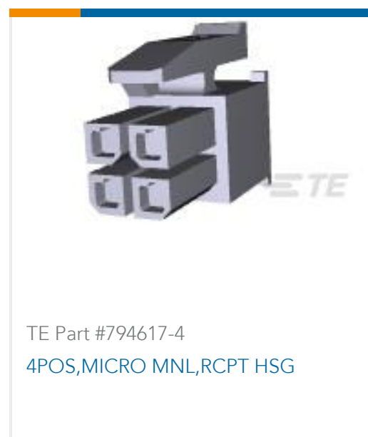
TE Part #794617-4 4POS,MICRO MNL,RCPT HSG