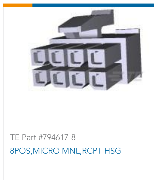
TE Part #794617-8 8POS,MICRO MNL,RCPT HSG