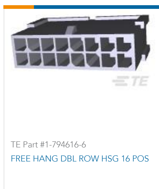
TE Part #1-794616-6 FREE HANG DBL ROW HSG 16 POS