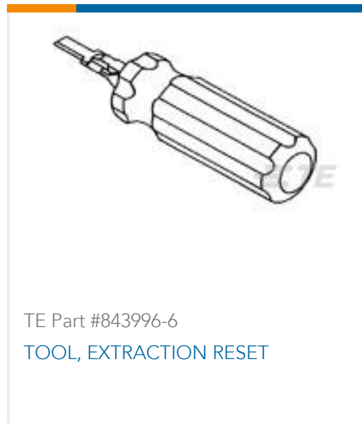
TE Part #843996-6 TOOL, EXTRACTION RESET