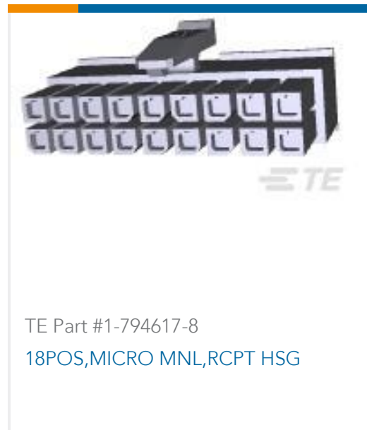
TE Part #1-794617-8 18POS,MICRO MNL,RCPT HSG