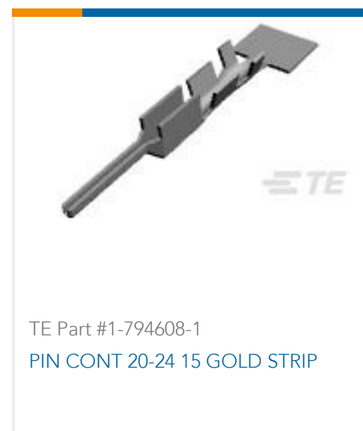
TE Part #1-794608-1 PIN CONT 20-24 15 GOLD STRIP