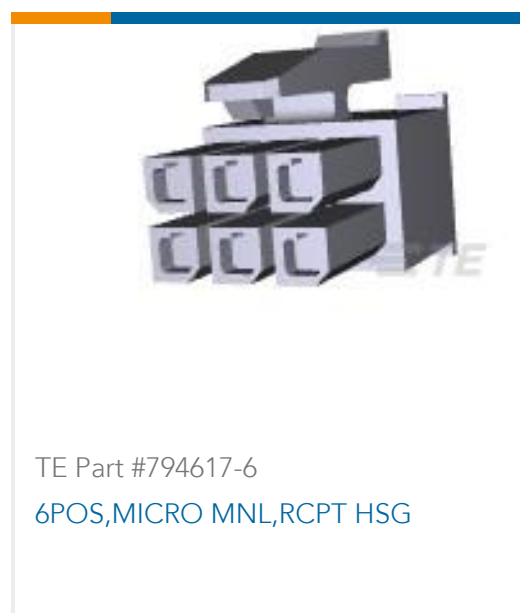
TE Part #794617-6 6POS,MICRO MNL,RCPT HSG