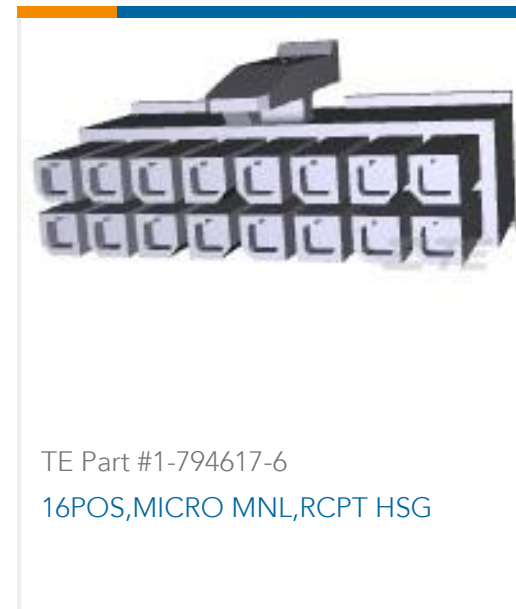
TE Part #1-794617-6 16POS,MICRO MNL,RCPT HSG