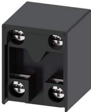
Contact block for position switch 3SE51/52 1 NO/1 NC quick action contact Short stroke