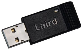
BT820 – Packaged BTv4.0 USB dongle

The BT800 series of USB HCI modules and packaged dongle are Laird’s first dual-mode Bluetooth v4.0 offerings, bringing support for Classic Bluetooth and Bluetooth Low Energy (BLE) in a tiny package.