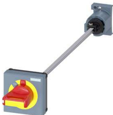
door-coupling rotary operating mechanism EMERGENCY OFF, size S00...S3 330 mm shaft