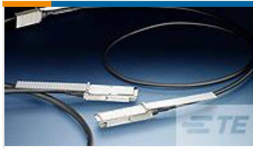
TE Part # 2202165-5 QSFP TO QSFP, 26AWG, FDR, 5.0 METER