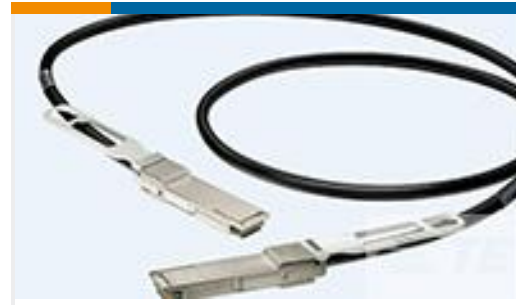
TE Part # 2829040-6 QSFP IB EDR, 30AWG, 2.0M