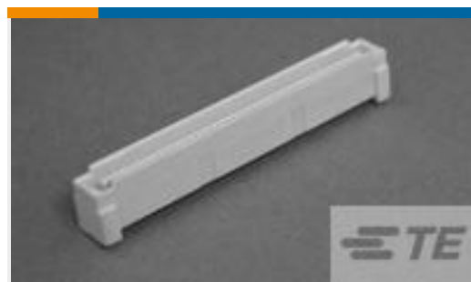
TE Part #5179031-3 0.8FH,P08H.5,080,08/Sn,TU