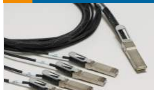
TE Part # 2821033-8 QSFP TO [4]SFP+, 28G, 1M, 33AWG