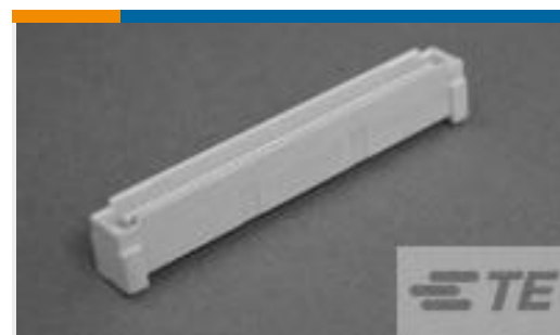
TE Part #5179031-2 0.8FH,P08H.5,060,08/Sn,TU