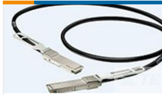
TE Part # 2829040-4 QSFP IB EDR, 30AWG, 1.0M