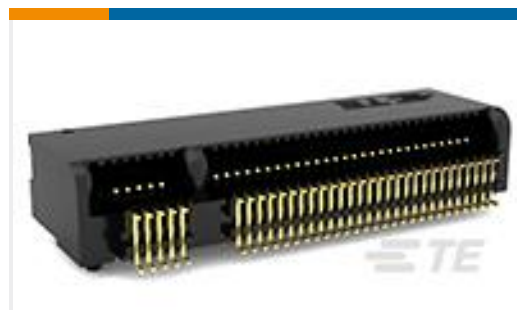
TE Part #2199230-5 M.2 0.5PITCH 4.2H KEY B 30U" AU