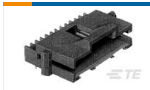
TE Part #5-104074-1 10 SYSTEM 50 HDR SRRA SHRD SN