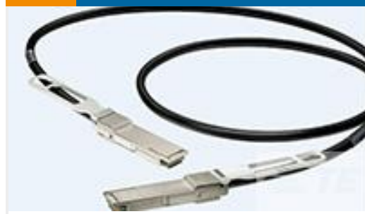
TE Part # 2829040-8 QSFP IB EDR, 26AWG, 3.0M