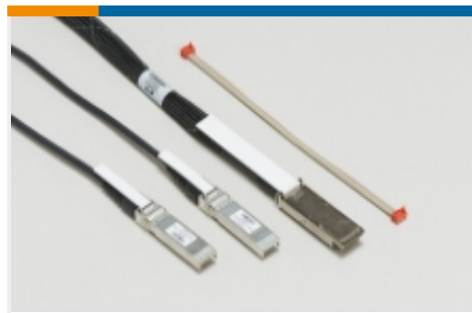
Pluggable I/O Cable Assemblies(23)