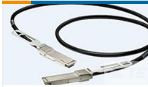
TE Part # 2829040-2 QSFP IB EDR, 33AWG, 1.0M