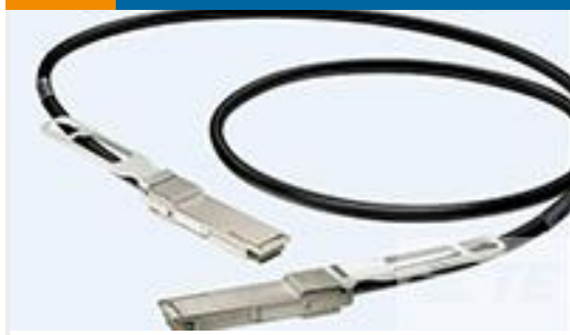
TE Part # 2829040-7 QSFP IB EDR, 26AWG, 2.0M