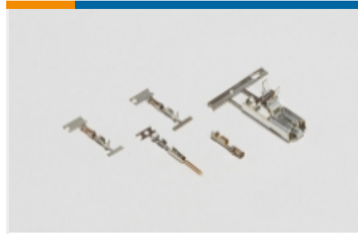
Wire-to-Board Connector Contacts(32)