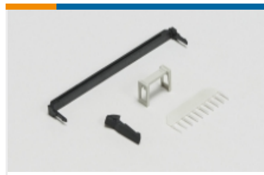
Ribbon Connector Accessories(1)