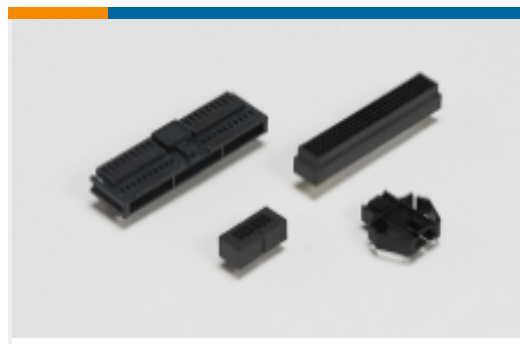
PCB Connector Shrouds(40)