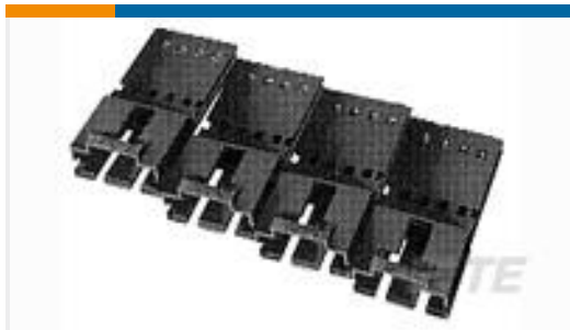
TE Part #103653-1 02 MTE SHRD PIN HSG SR LATCH