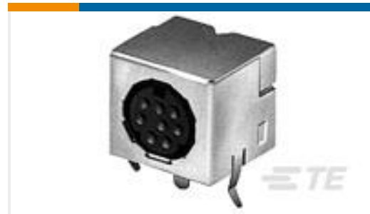
TE Part #1658998-1 Mini DIN, 8 pos, R/A, Shield