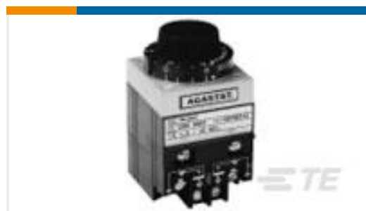
TE Part #2-1423164-2 7022PD=RLY,STD,OFF,2P,125VDC,5