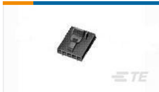
TE Part #104257-4 05 MTE RCPT HSG SR LATCH .100