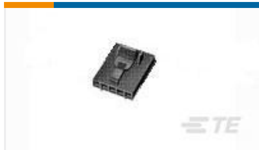
TE Part #104257-3 04 MTE RCPT HSG SR LATCH .100