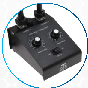
Light Adjustment Knobs for Each Illuminator and On/Off Switch on Metal Base