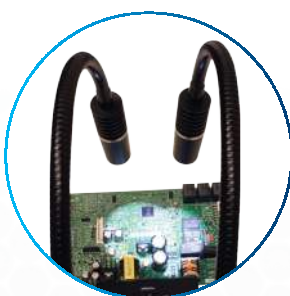
Illuminate and Overlap Spotlights at Any Angle