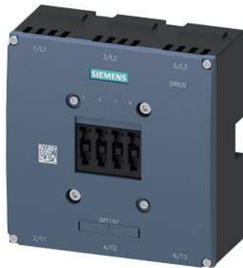
Arc chute for 3RT1075