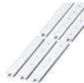
Zack marker strip, Strip, white, Unlabeled, Can be labeled with: Plotter, Mounting type: Snap into tall marker groove, For terminal block width: 12.2 mm, Lettering field: 12 x 10.5 mm

Zack marker strip - ZB 12:UNPRINTED - 0812120