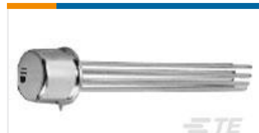
TE Part #1617125-2 JMAW-12XM = M39016/9-016M