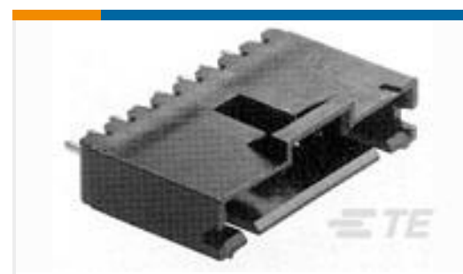
TE Part #5-104363-6 07 MTE HDR SRST LATCH .100CL