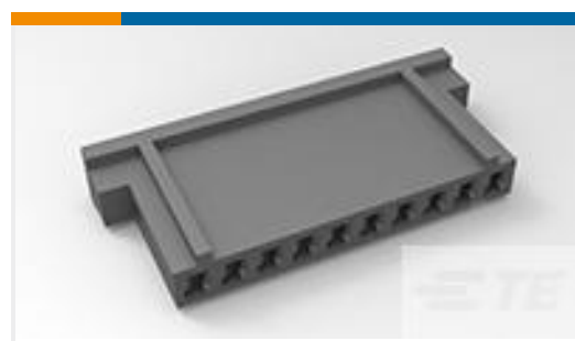
TE Part #88859-2 008 HOUSING FFC RCPT SR 100CL