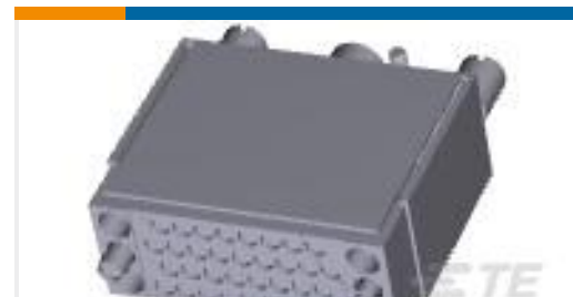
TE Part #213932-3 M-SERIES KIT,V.35,34P,UNASSM