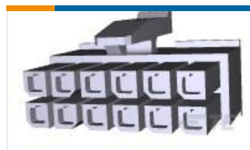
TE Part #1-794617-2 12POS,MICRO MNL,RCPT HSG