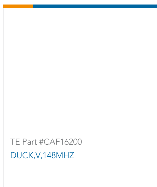
TE Part #CAF16200 DUCK,V,148MHZ