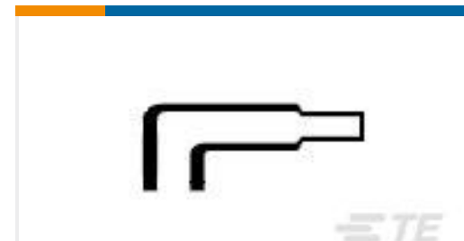
TE Part #808036-000 234A142-3-0